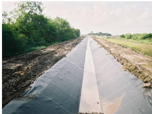
USA, Harlingen (Texas) Irrigation District, 14.600 m 2 , 2003