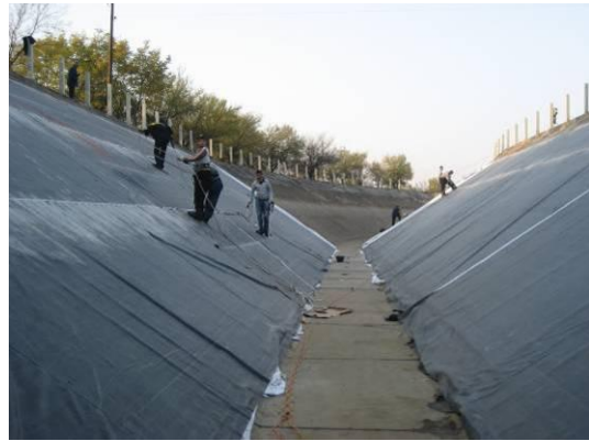
Serbia, Vlasinske Hidroelektrane, 2008