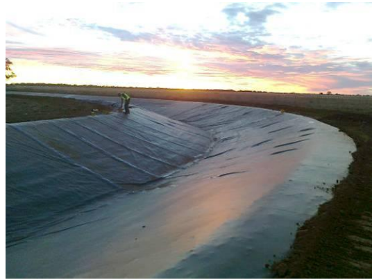
Australia, Triangie Nevertire Irrigation Scheme, 150 km, 2012-2013