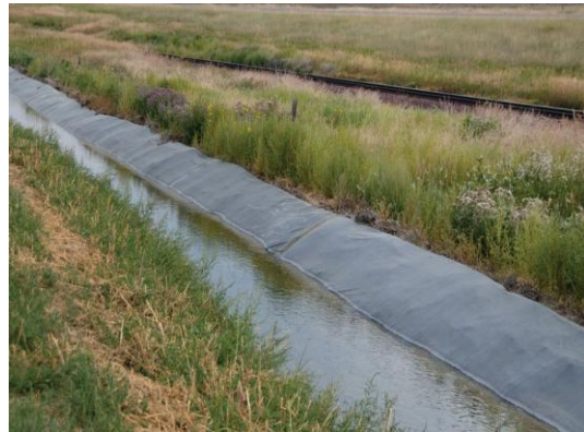
USA, Greenfield Irrigation District, 8.2 km, 2007