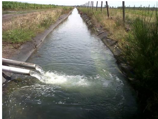
France, Canal Landes, 2 km, 1994