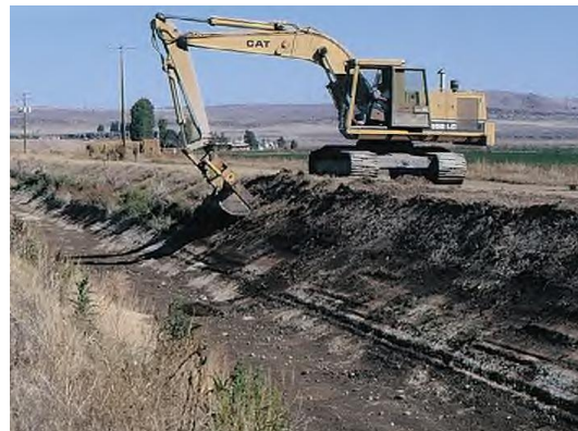
USA, Tulelake Irrigation District, 3.7 km, 2002