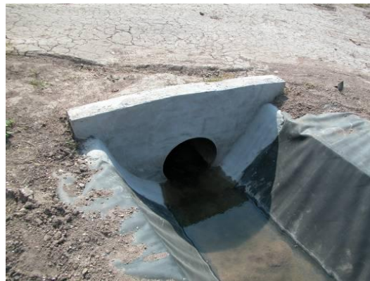
USA, Hidalgo Irrigation District #1, February 2002