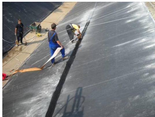
Serbia, Vlasinske Hidroelektrane, 2010