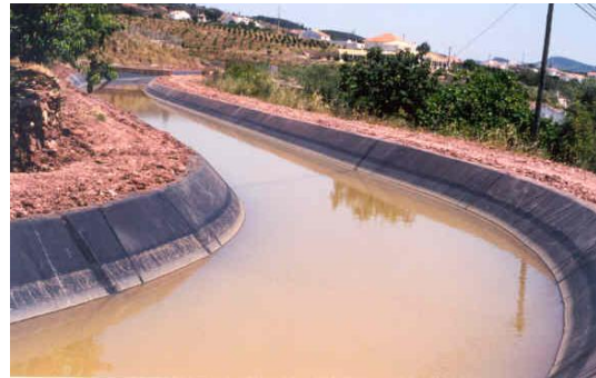
Portugal, Silves, 3 km, 2000