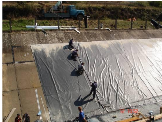
Serbia, Vlasinske Hidroelektrane, 2006