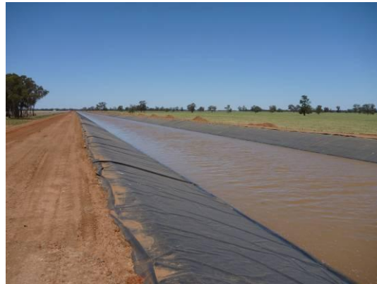
Australia, Triangie Nevertire Irrigation Scheme, 150 km, 2012-2013